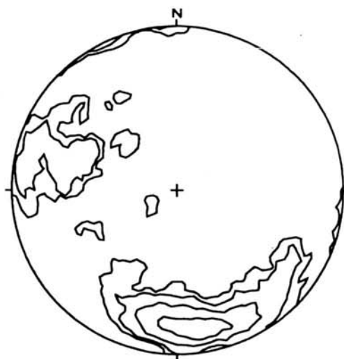
Fig. 2b: 247 Poles to schistosity, Bavarian part of GAM, equal area net, lower hemisphere, 1–2–5–10–20%